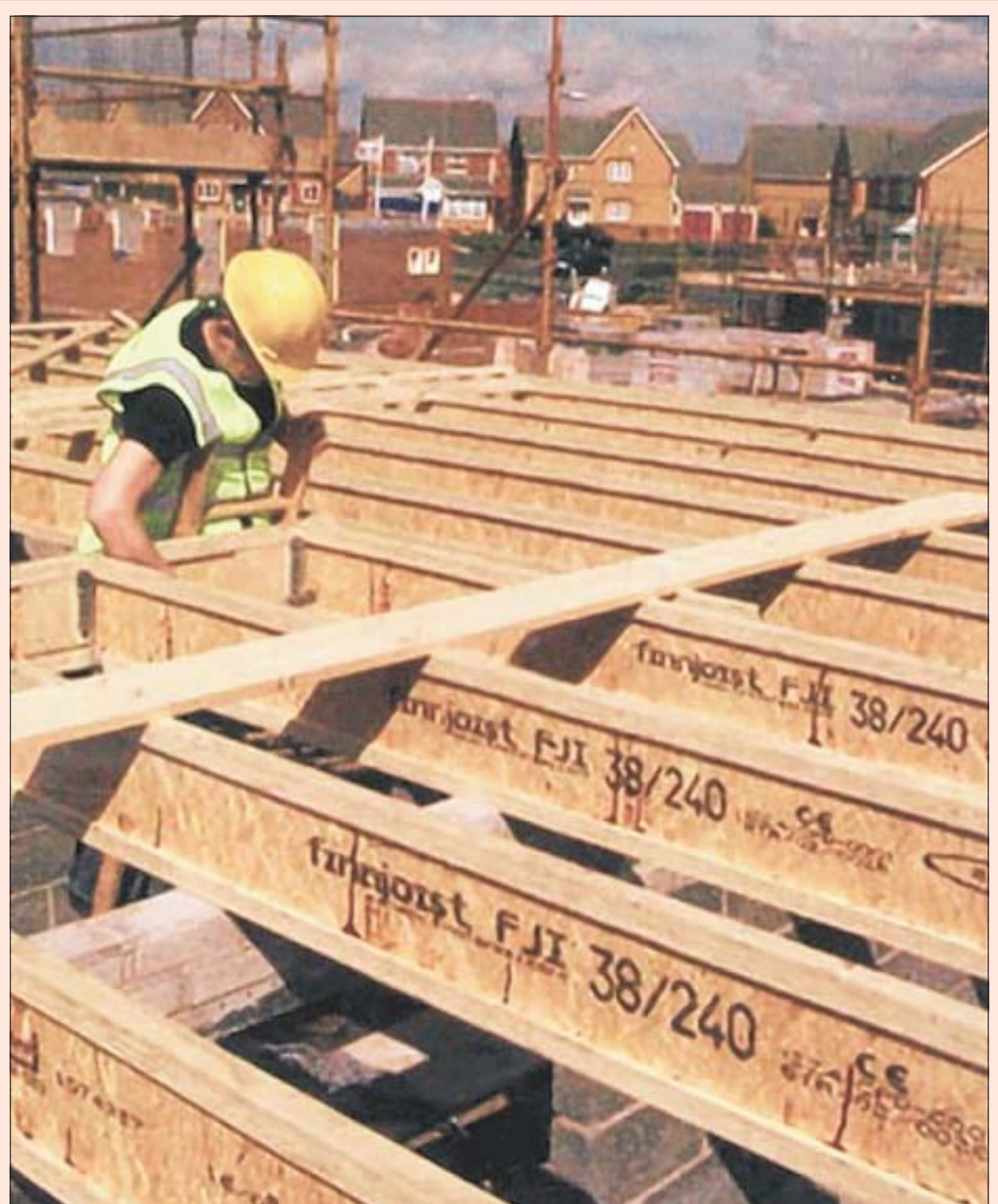
■ HASSLE-FREE: the 'I' Joist floor system is strong, stable and lightweight – and prevents squeaking

Our team of multi-tasking designers is always on hand to discuss any project and advise where necessary.